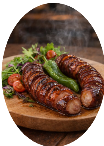
Smokey Grill Chorizo 10,50€

A fresh and flavorful salad featuring creamy mozzarella, crisp green beans, and a light, refreshing dressing. A perfect balance of textures and tastes!