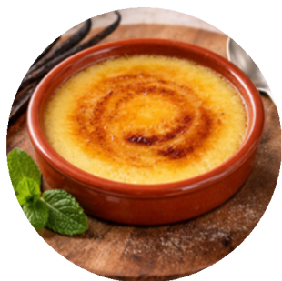
Cream Burlée 7,50€

(Cream, Egg, Sugar, Vanilla with a sugar Crust)