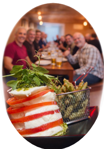
Salada Mozzarella c/Judia Verde 10,50€

A fresh and flavorful salad featuring creamy mozzarella, crisp green beans, and a light, refreshing dressing. A perfect balance of textures and tastes!