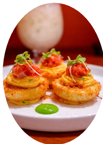
Ovos Verdes do Chef 12,50€

Flame-grilled chorizo, bursting with smoky flavors, served with a fresh and crisp salad.