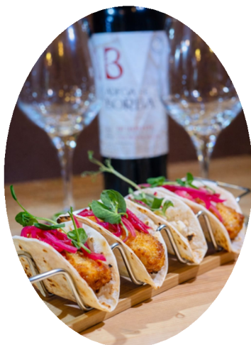
Fried Fish Tacos 12,00€

Crispy golden green eggs, perfectly crunchy on the outside, paired with a delicate tartare of fresh tuna.